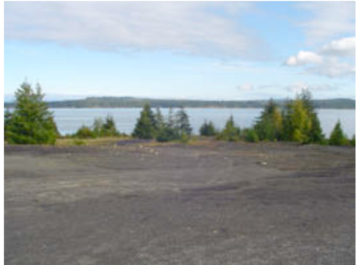
Proposed development site near Comox.

Unfortunately, the significance of my work was greatly diminished by the Ministry of Environment (ironic?). It seems the mischievous elves that work the switches and levers within the bowels of the Ministry had recently released the Regional District from the Act's zoning requirements. This does not mean that the developers now have a carte blanche to go ahead with their plans—but it is a set-