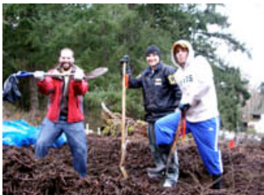
Entrenching lawyers' dirty reputations.

Despite disbelief from community residents, the ELC sent a crew of planters to restore native species to a site at Mt. Douglas Park in Saanich. The volunteers ranged from grizzled vets to 'green' rookies.