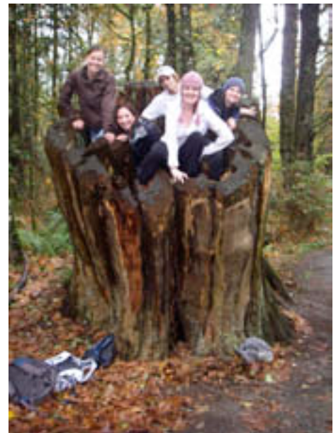
They'd live here if it wasn't illegal.