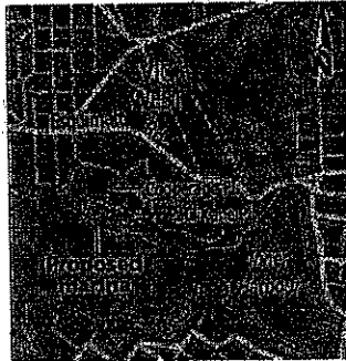
The marina would be built along the shore of the Songhees development.